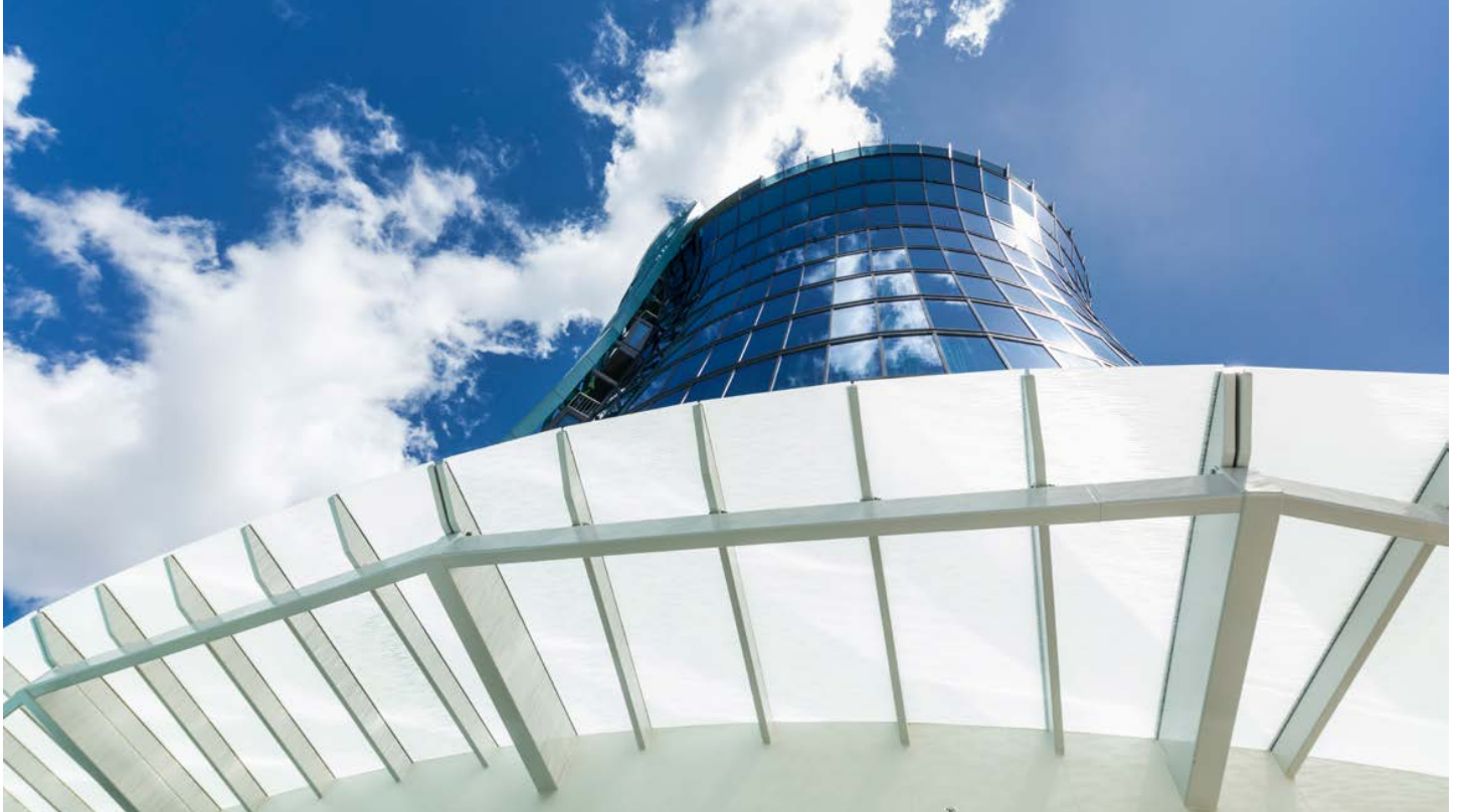
TW image printed with 17.52mm clear toughened SGP laminated - Riley Hotel Cairns

A range of standard and customised designs are available for overhead glazing applications. Typically printed on clear or extra clear glass, then tempered and laminated to comply with Australian Standards.