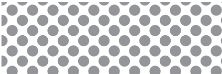
Dot 3mm @ 45°