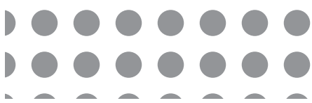
Dot 5mm @ 90°