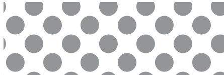
Dot 5mm @ 45°