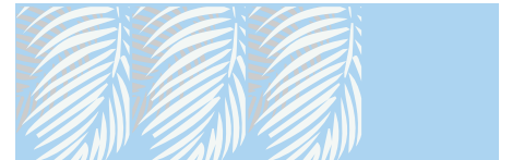
Palm Leaves (blue showing visible sections)