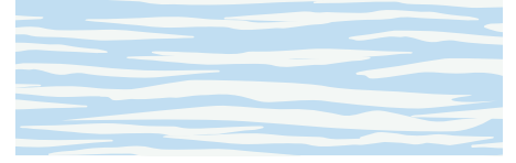
TW (blue showing visible sections)