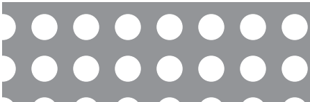
Dot 5mm Reversed @ 90°