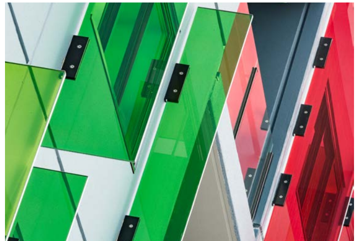
Custom laminated 17.52mm heat strengthened glass panels with Vanceva@coloured interlayers - Baxter St Apartments