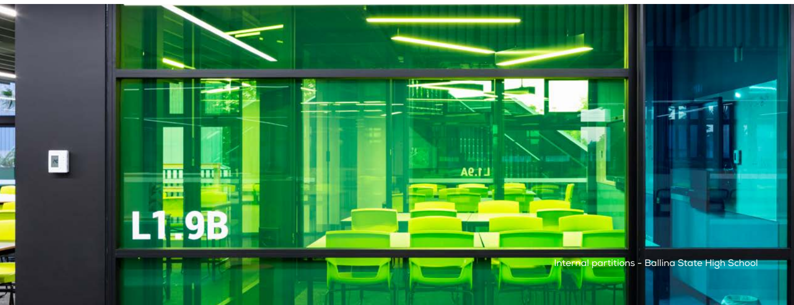
Internal partitions - Ballina State High School