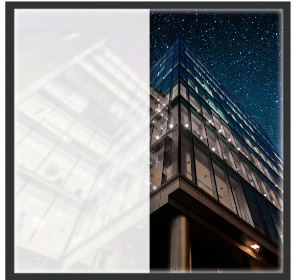
Arctic Snow (Std Translucent offer)