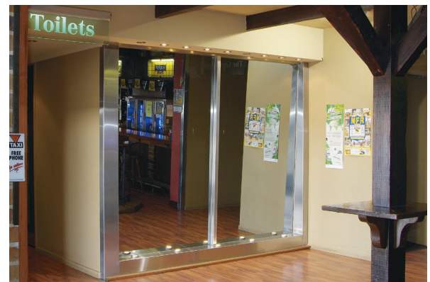
Laminated one way mirror – Subject side view from outside of men's restroom, lighting maximised to prevent see through.