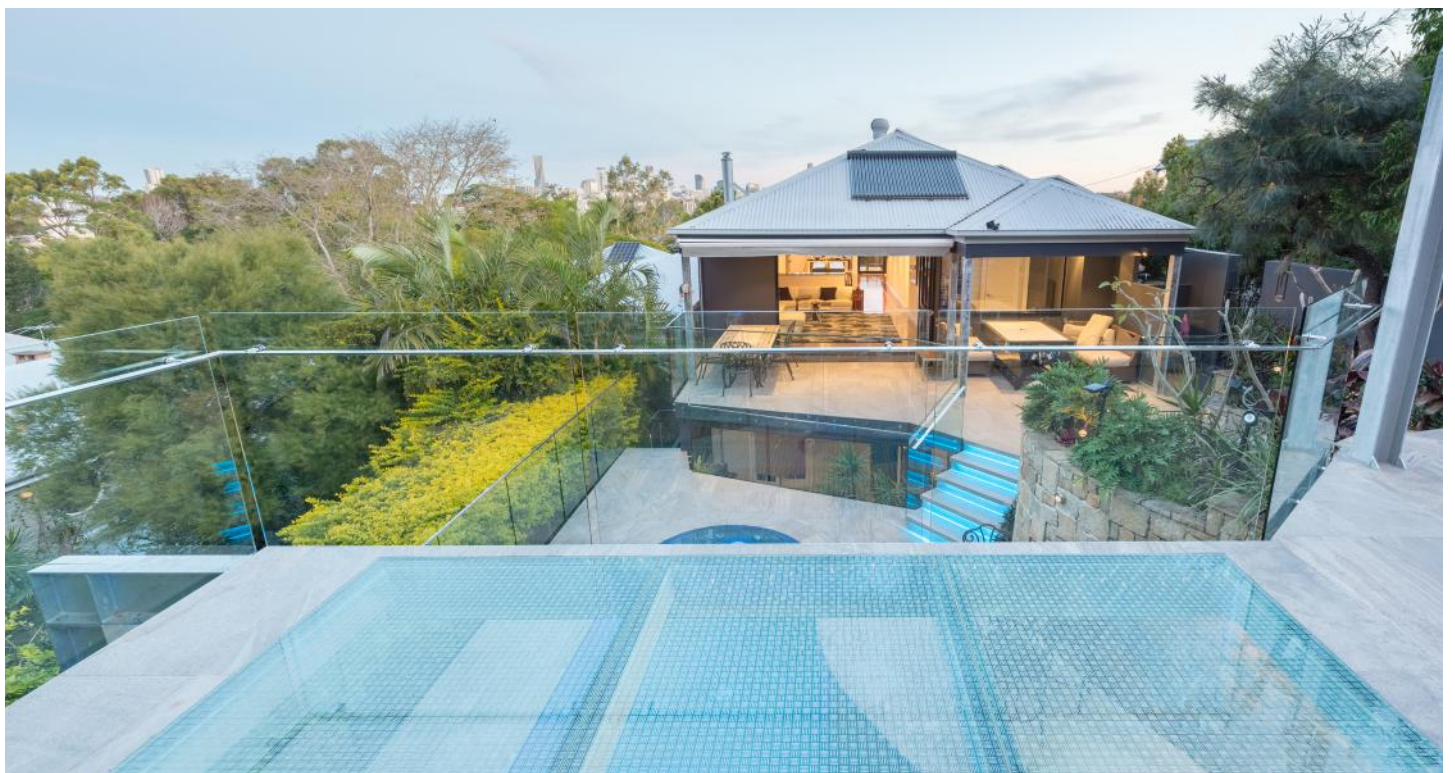
ImageTek™ FLOOR - Windsor