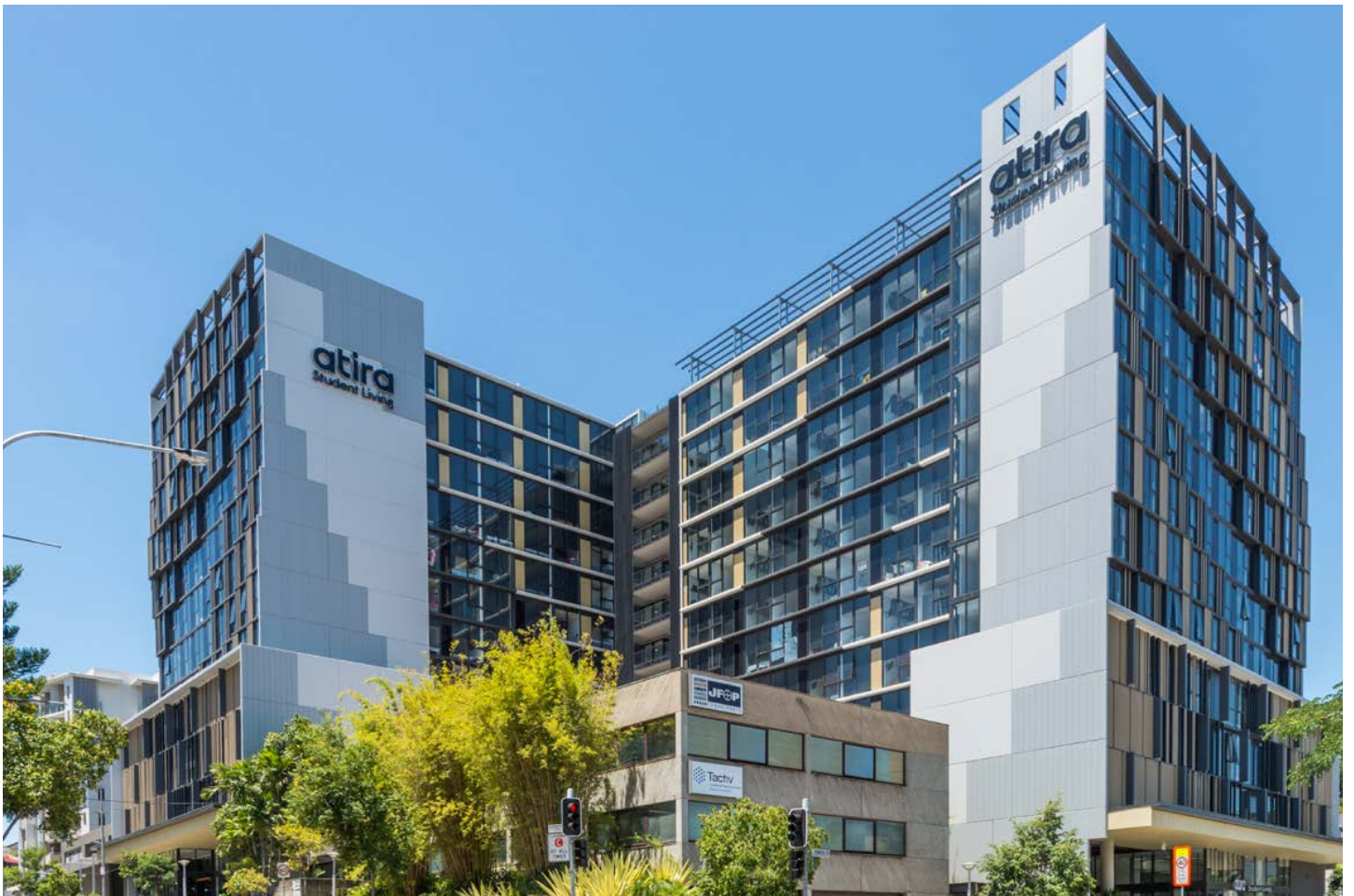
ImageTek™ COLOUR- Sandbank Atira Student Living