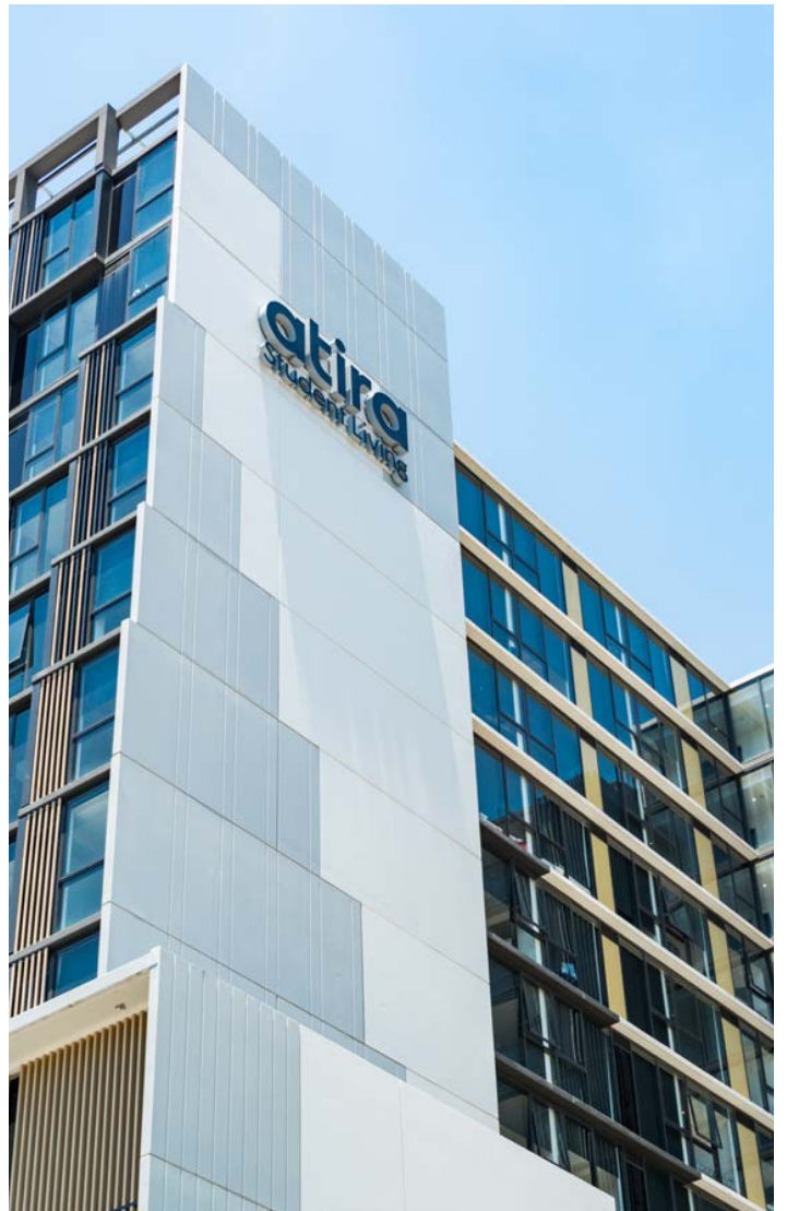
ImageTek™ COLOUR- Sandbank Atira Student Living